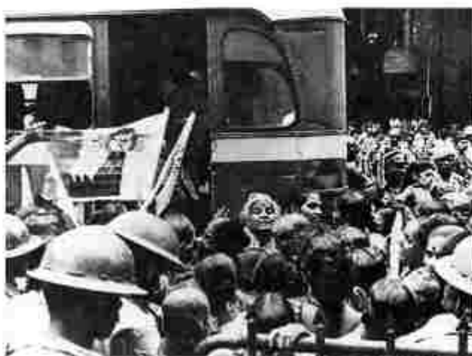
Top: Bombay textile worker's strike 1981-82