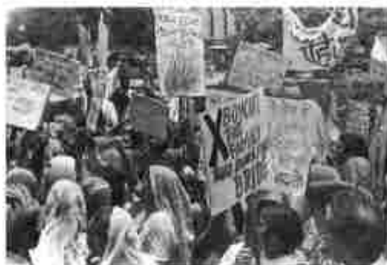
Struggle against dowry

Apart from organisational changes, there were new issues that were focussed upon. For instance, violence against women. Over the years, there have been numerous campaigns that have been taken up. You may have noticed that application for school forms have both father's and mother's names. This was not always true. Likewise, important legal changes have taken place thanks to the campaign by the women's movement. Issues of land rights, employment have been fought alongside rights against sexual harassment and dowry.