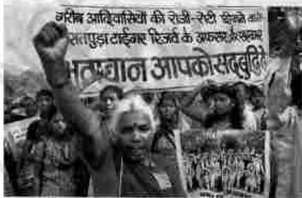
Struggles of the tribals continue

We will not be able to go into any detailed account of the different movements. We take Jharkhand as an example of a tribal movement with a history that goes back a hundred years. We also briefly touch on the specificity of the tribal movements in the North East but fail to deal comprehensively the many differences that exist between one tribal movement and another within the region.