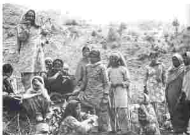
Discussing deforestation, Junagadh, Himachal Pradesh.

This conflict placed the livelihood needs of poor villagers against the government's desire to generate revenues from selling timber. The economy of subsistence was pitted against the economy of profit. Along with this issue of social inequality (villagers versus a government that represented commercial, capitalist interests), the Chipko Movement also raised the issue of ecological sustainability. Cutting down natural forests was a form of environmental destruction that had resulted in devastating floods and landslides in the region. For the villagers, these 'red' and 'green' issues were interlinked. While their survival depended on the survival of the forest, they also valued the forest for its own sake as a form of ecological wealth that benefits all. In addition, the Chipko Movement also expressed the resentment of hill villagers against a distant government headquartered in the plains that seemed indifferent and hostile to their concerns. So, concerns about economy, ecology and political representation underlay the Chipko Movement. Trees are necessary for the conservation of environment. Similarly, clean water is necessary for a healthy environment. In the light of this, the Government of India since 2014 has initiated systematic efforts to bring balance, structure and quality of India's ecology through the 'Integrated Ganga Conservation Mission' (Namami Gange) and 'Swachh Bharat Abhiyan'.