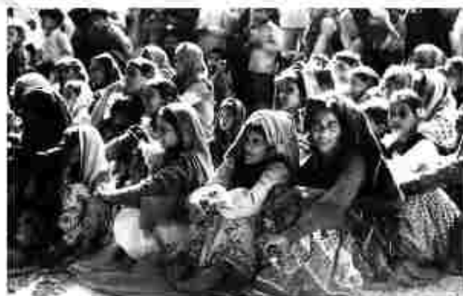
Chipko activists gather on World Environment Day at Saklana in 1986

Find out some instances of environmental pollution from your region. Discuss. You can also have a poster exhibition of all your findings.