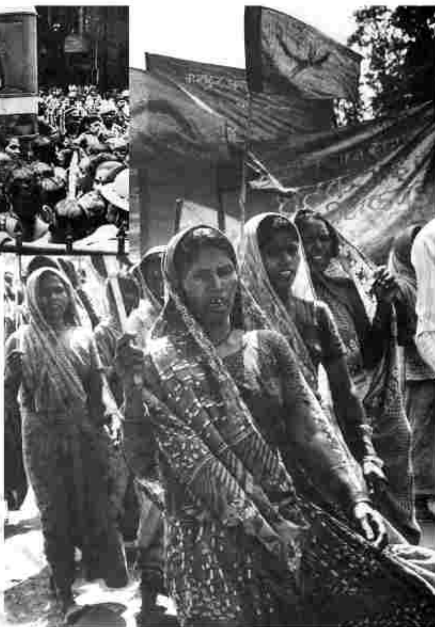
Right: Women workers at a Union Demonstration, Arrua, Bihar 1987